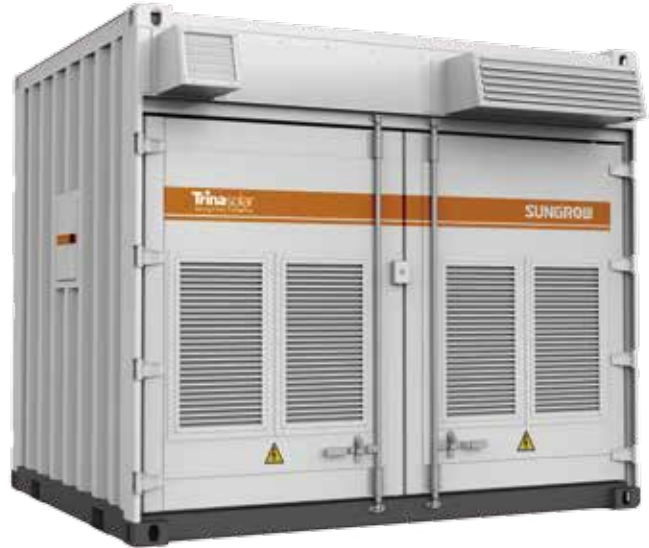
SUNGROW Inverter, Designed For TrinaPro