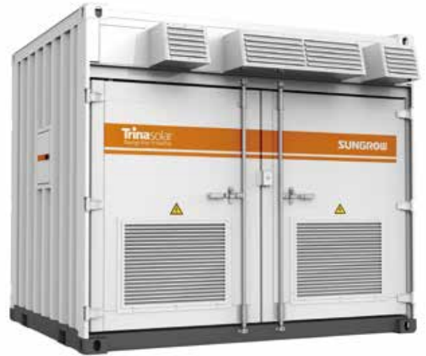
SUNGROW Inverter, Designed For TrinaPro